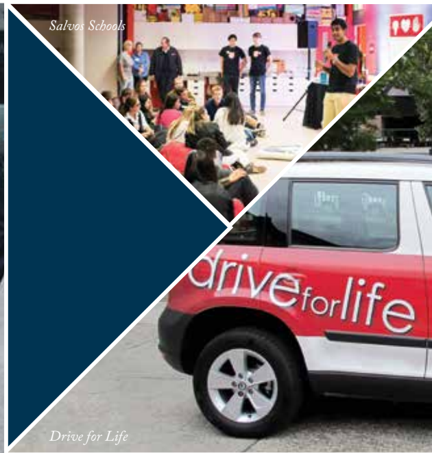
Drive for Life