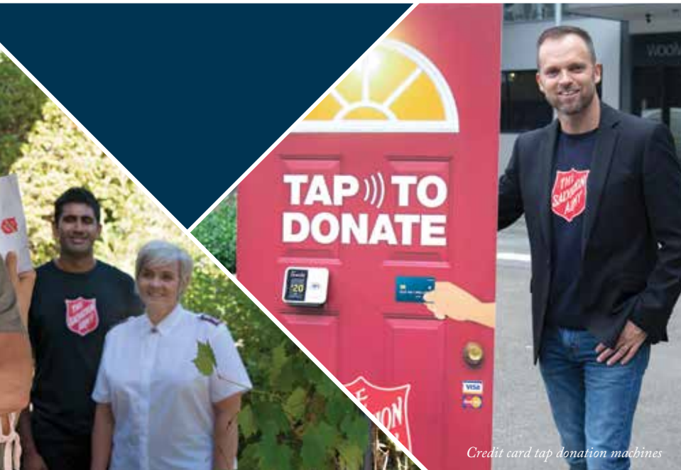
Credit card tap donation machines