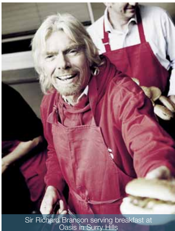
Sir Richard Branson serving breakfast at Oasis in Surry Hills

Hundreds more find ongoing support through a range of Oasis services including short term emergency accommodation, alternative schooling, and vocational training and traineeships. Thousands of others are assisted through the wider Oasis network throughout NSW, Queensland and the ACT.