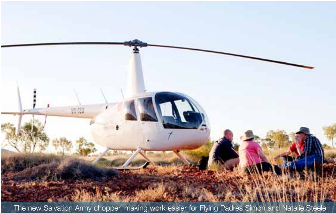
The new Salvation Army chopper, making work easier for Flying Padres Simon and Natalie Steele

"During the floods people were airlifted out of their properties, but couldn't stay away, with stock to care for. So they had to go back to incredibly remote properties, often hundreds of kilometres from the nearest neighbours, with no services. There was no electricity because generators had been flooded, no fridges, nothing. We were able to get in and help fix up trucks and tractors, and clean the thick mud out from the rooms.