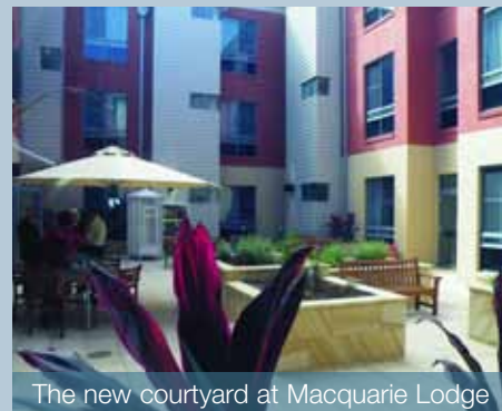
The new courtyard at Macquarie Lodge

The new building, complementing the existing independent living on site, includes three levels and a basement. In a written message, Federal Minister for Ageing, Justine Elliott said: "This new multimillion-dollar home incorporates The Salvation Army's core beliefs that every person deserves the utmost in dignity, choice, respect and understanding in every facet of its construction and operation."